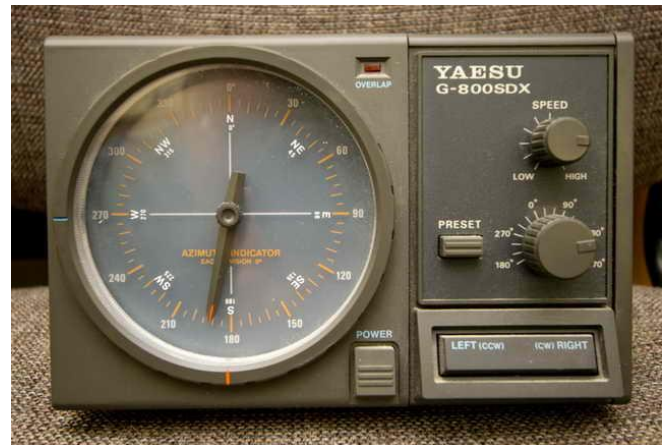
Yaesu Rotor Control