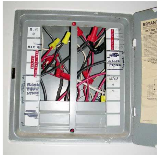
Breakers keep tripping, so let's just take 'em out