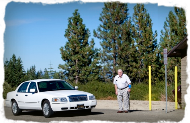
Herb, W6 HBU and Russell, KB6YAF at the Rest Stop on Bucks Lake/Quincy Rd - Site of the Day 2 "Beckwourth Bike Ride"