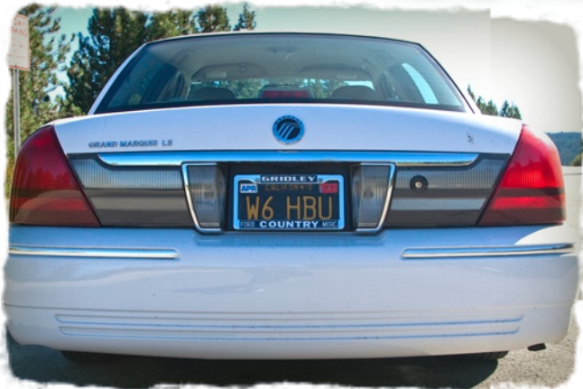
Herb, W6 HBU's "The Sofa"