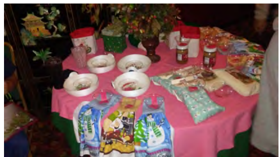
Door Prizes: Handmade Items, Honey & More!