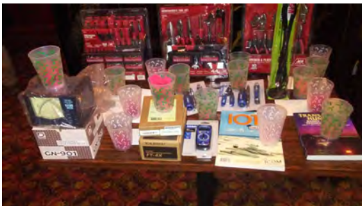
Door Prizes: Ham Radio Equipment, Gift Certificates, & Tools