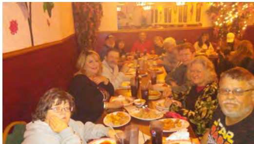
Plenty of Food & Fun